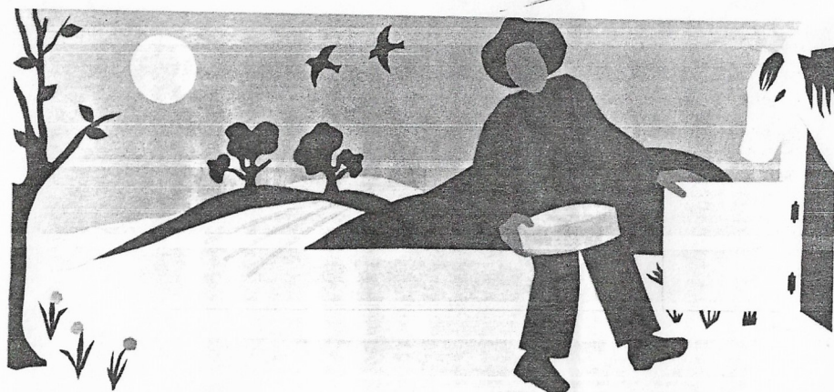
60. ORIGINAL ILLUSTRATION FOR "THE WONDERFUL FEAST" 1938 (restored by the artist in 1991) Collage on cardboard